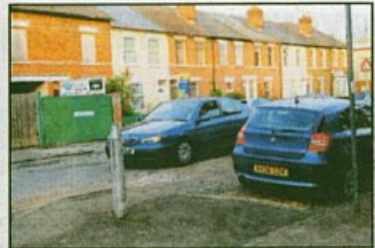
RED-HANDED – Above and below, a driver dashes down Northfield Road before being flagged down