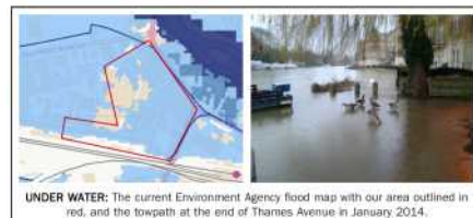
UNDER WATER: The current Environment Agency flood map with our area outlined in red, and the towpath at the end of Thames Avenue in January 2014.