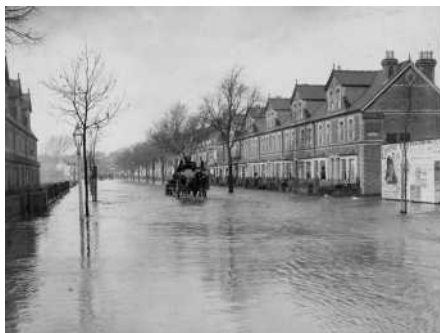
NOW AND THEN (clockwise from top left): Thames Side and the tow path, a car stranded in Caversham, Caversham Road in 1894, and again in 1947.

After seeing exceptionally high river levels in recent weeks, we have been preparing an emergency plan for our area and are in touch with council officers for advice. We are endeavouring to provide a simple guide to what we can expect to happen in an emergency so that we can all be better prepared.