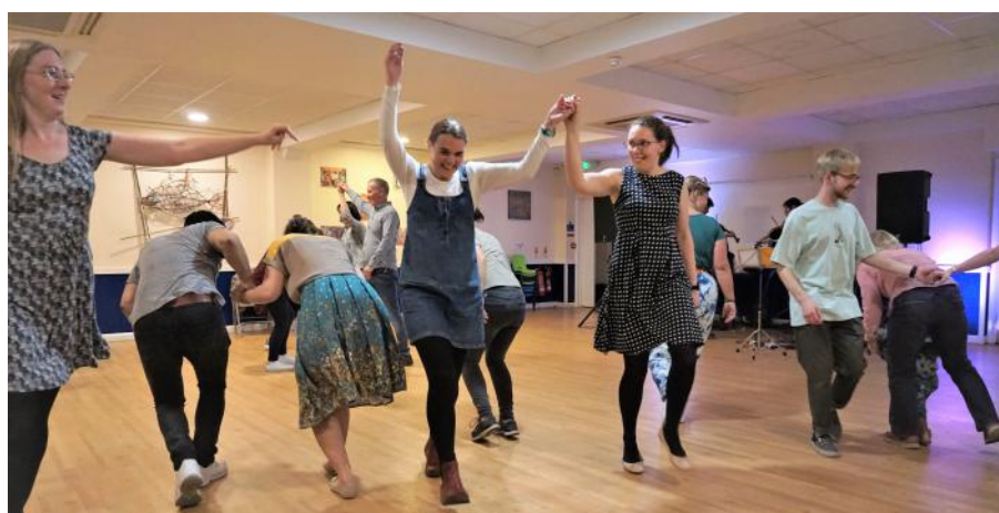
ARE WE GOING THE RIGHT WAY? Participants enjoying fun and dancing at the Bell Tower ceilidh

Local residents tossed their inhibitions to the wind as they took to the floor at Bell Tower's first-ever ceilidh at New Hope on Friday 14 October.