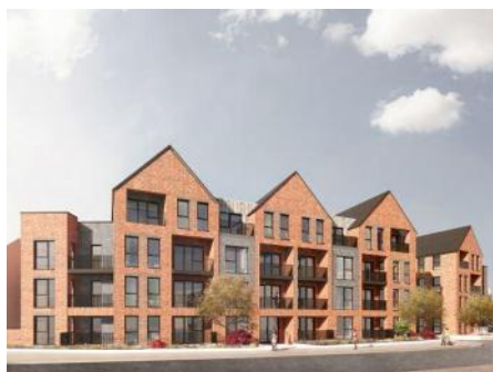
NEW DEVELOPMENT (clockwise from top left): the facade of Carters as it is today, the expected layout, proposed new street frontage, and inside the development.

With the new houses on the corner of Northfield and Swansea Roads nearing completion, attention now turns to the rest of the former Carters site, where a planning application has recently been submitted for a new housing estate.