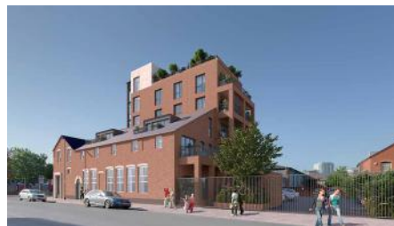
COMING SOON: a simulation of the proposed Dreads site development as seen from Northfield Road, and the Printworks estate nearing completion.