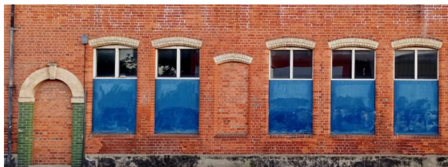
UNDER ATTACK: Recent graffiti on the former Drews building in Northfield Road, cleaned up by Bell Tower's G-Team.

You might have noticed that there has been a large increase in graffiti activity in Reading in the last couple of years – and that in our area the graffiti usually disappears quickly.