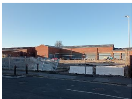
UNDER CONSTRUCTION (clockwise from top left) Swansea Road development and plans, the former Manrose site, and an impression of the Printworks.

The new houses in Swansea Road are now going up fast, and we like the look of the bricks that have been chosen for the project, which will match the houses opposite. The entire development is expected to be of affordable housing and we look forward to seeing it completed.