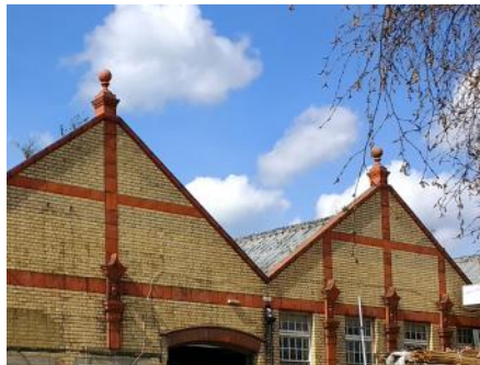
COMING SOON: the council's map of our area as shown in the draft Local Plan (left) showing a development on the Cox & Wyman site (right)

Reading Borough Council has been developing plans to help guide future developments up to 2036. The plans set out how the council will tackle the need for substantial new development over the next two decades, including up to 700 new homes each year.