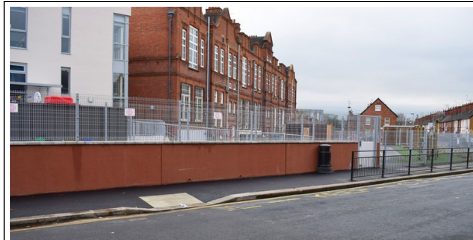
SCHOOL CHANGES: Some of the zigzag lines that are proposed for removal

As usual the skip was kindly sponsored by Reading Festival organisers Festival Republic. Many thanks also to Mel Maxwell of Sandbag Ltd for use of the site. We hope to be back for another tidy-up day in the same place next summer.