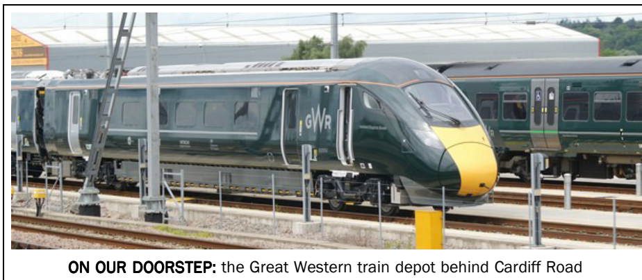
ON OUR DOORSTEP: the Great Western train depot behind Cardiff Road

more diesel units than originally planned being based at Reading depot after the summer 2019 date for the completion of electrification. This means that the railway companies can no longer say the problem of noise and pollution will solve itself through electrification and makes it more imperative for a solution to be found.