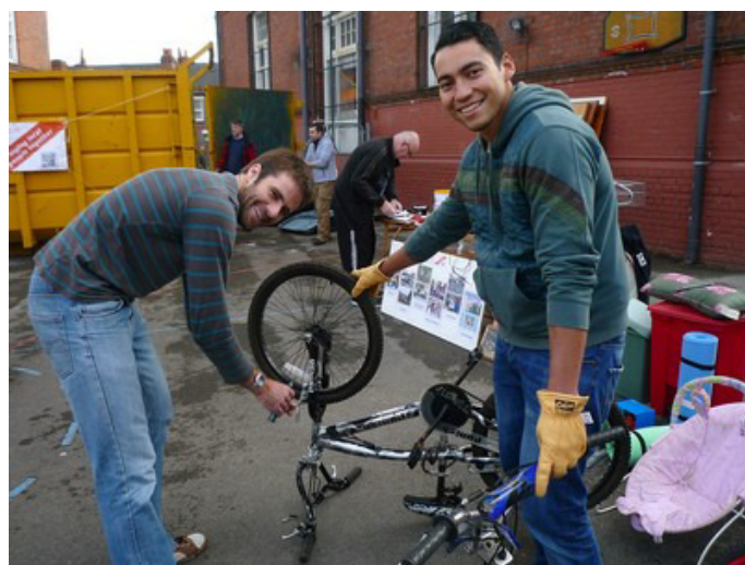
(Clockwise from top left): helping plant trees in Richfield Avenue (2011), fun and games at our first street party (2012), recycling old bicycles (2013), and everything and the kitchen sink at our recent Big Skip day (2015)