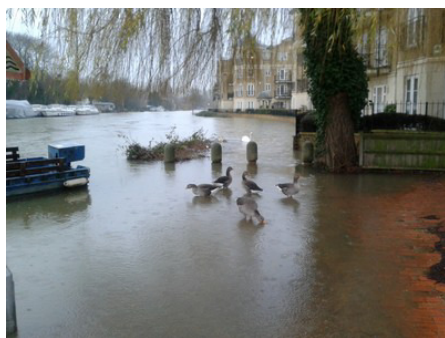
UNDER WATER: The current Environment Agency flood map with our area outlined in red, and the towpath at the end of Thames Avenue in January 2014.

The area around the Thames in Reading has escaped serious flooding this winter, but the news has been full of stories of flooded communities around the country. Reading has not escaped entirely - the army has been called out to repair river banks in Southcote, and several houses have been flooded there.