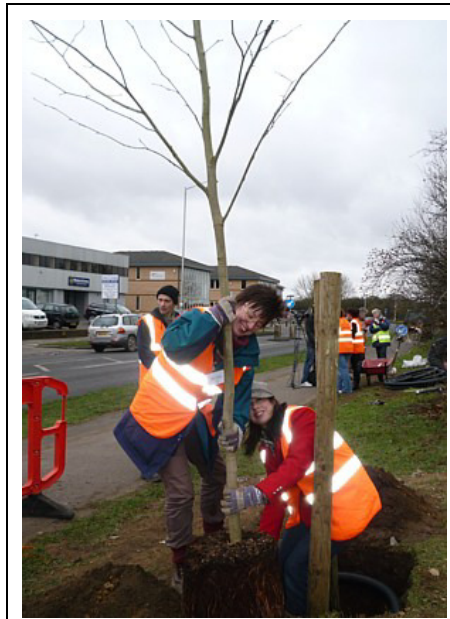
EASY DOES IT: Lifting a new tree into place

The event was the first held after the introduction of the council's Tree Warden scheme, where volunteers plant, monitor and maintain street trees in Reading.