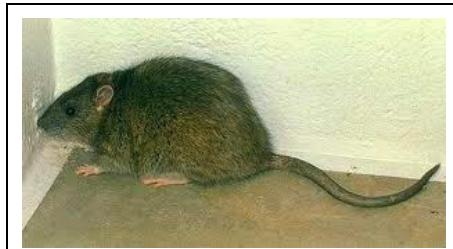
PEST: The common or brown rat

traps, even venturing into the dining room one night and gnawing through the partition wall into the cupboard under the stairs. After being flushed out, Basil disappeared again, eventually to be cornered behind the fridge. The sound of Basil's demise could be heard by the neighbours several doors away – we thought our next visitor would be from the RSPCA or perhaps social services – but we finally got rid of our last rat.