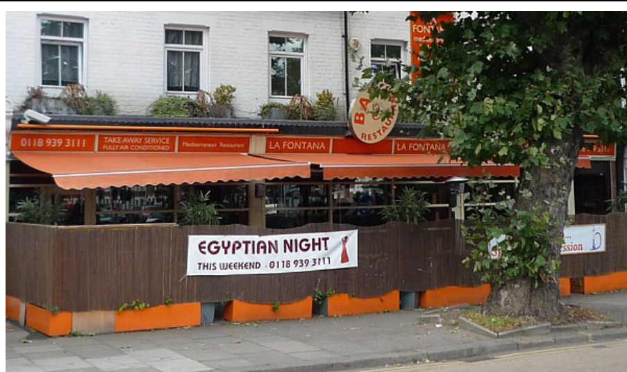
LIVELY VENUE: La Fontana restaurant in Caversham Road

La Fontana has recently come under new management and offers a wide range of food from around the Mediterranean and Near East. At weekends the restaurant really comes to life, with a variety of live entertainment from near and far. As