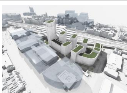
TOWERING ABOVE US: the proposed development

'Reading Metropolitan' will make a significant impact on the skyline around the station and could affect the Bell Tower area too. Blocks rising up to 24 storeys are proposed, and concerns have been raised about overshadowing of the area.